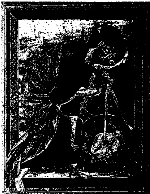
The God of Creation measuring the world with dividers, from a mid-thirteenth-century illustrated Bible from Reims

The issues that I have been asked to address here will seem to many to be terribly old-fashioned. The "argument from design" made by the English theologian William Paley is not on most peoples' minds these days. The prestige of religion seems today to de-